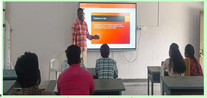
ICT Class –Political Science Dept