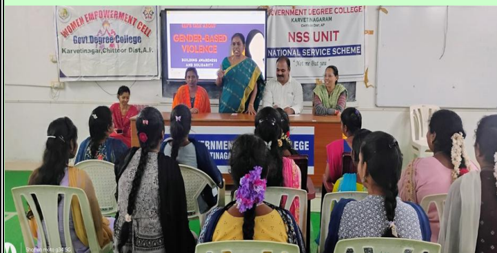
Gender Based Violence Awareness (WEC) Women Empowerment Cell