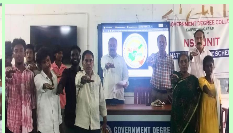
GOVT. of AP - SASA Program