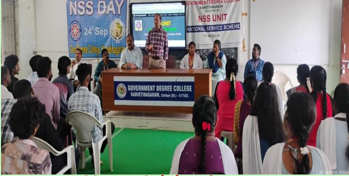
NSS Day Celebrations