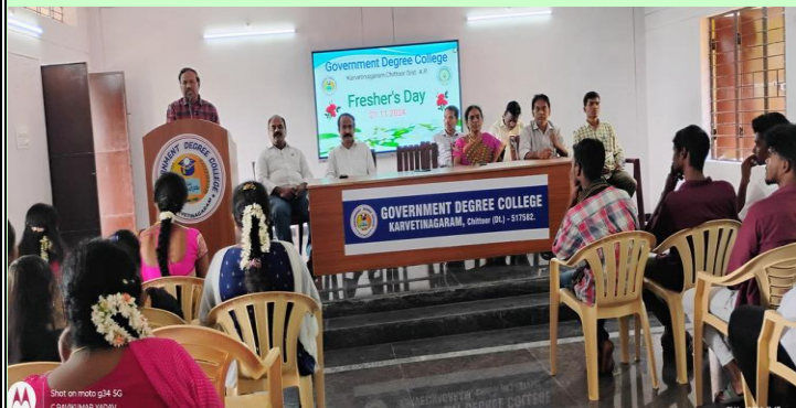
College Freshers Day