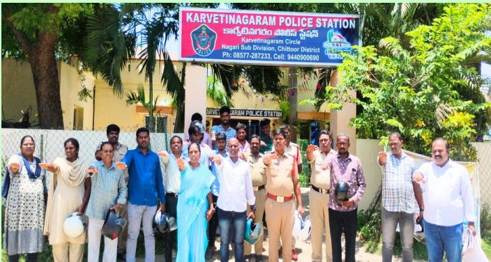
Road Safety awareness- NSS