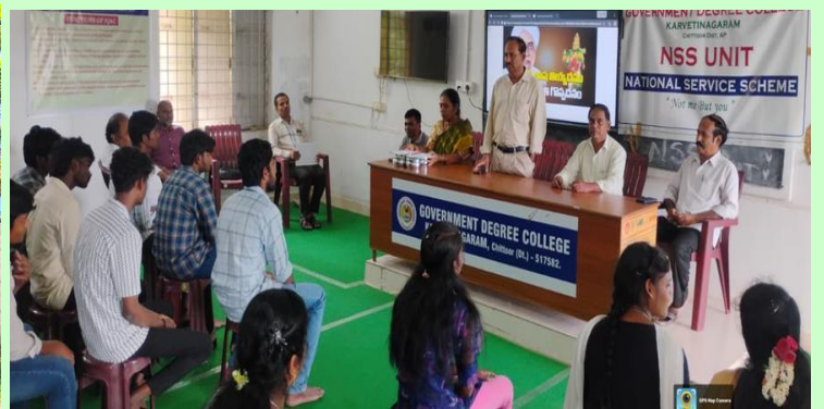
Telugu Basha Dinostavam – Telugu Dept