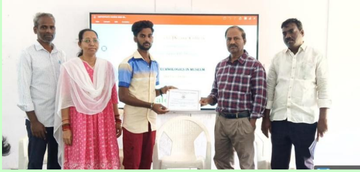
Certificate Course –Arts Dept