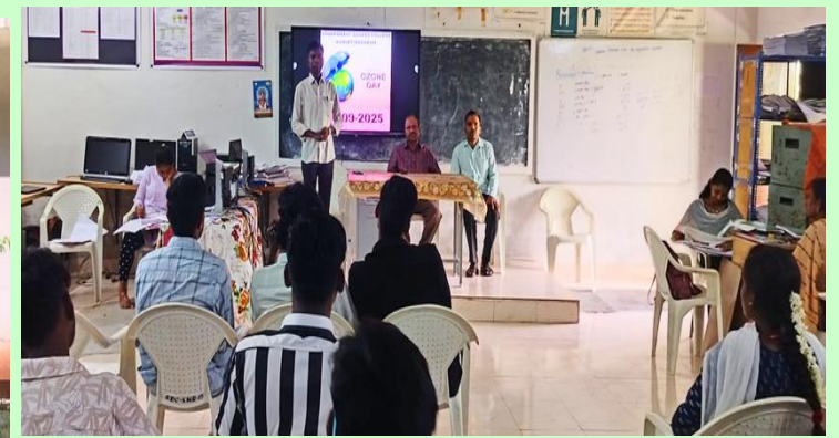
National Ozone Day- Physics Dept