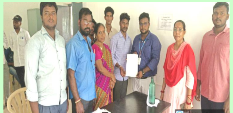
Appointment orders Received by students- JKC