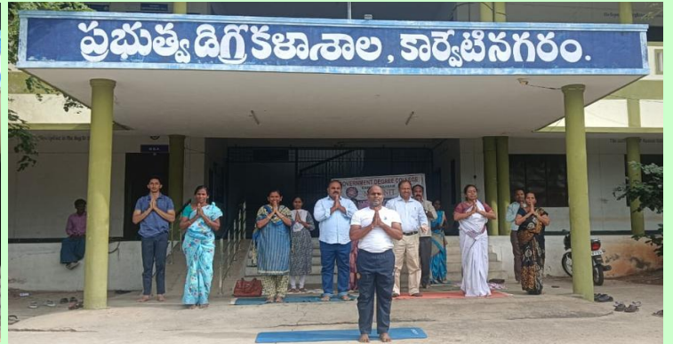
International Yoga Day – Physical Education