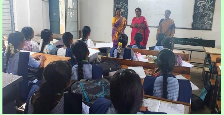
Extension Lecture – English Dept