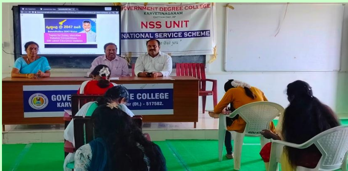
SWARNANDHRA @ 2047 VISION - NSS