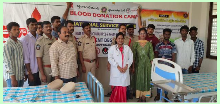
Blood Donation Program