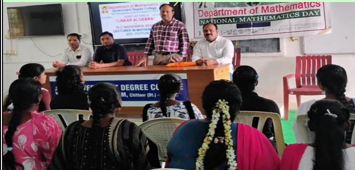
Guest Lecturer - Mathematics Dept