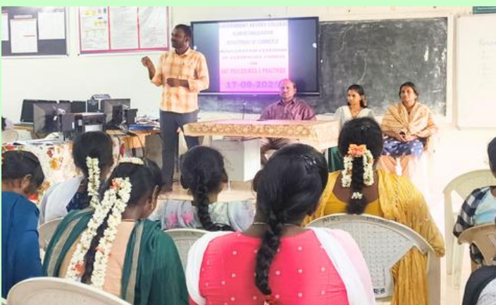
Certificate Course – Commerce Dept