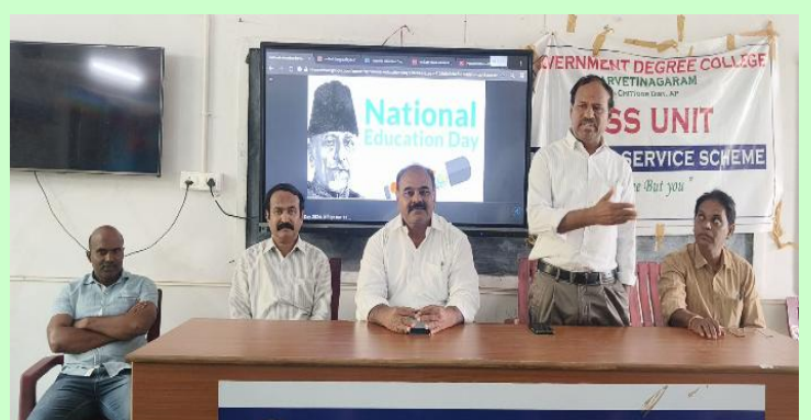
National Education Day