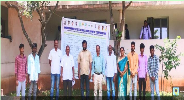
Job Mela - JKC