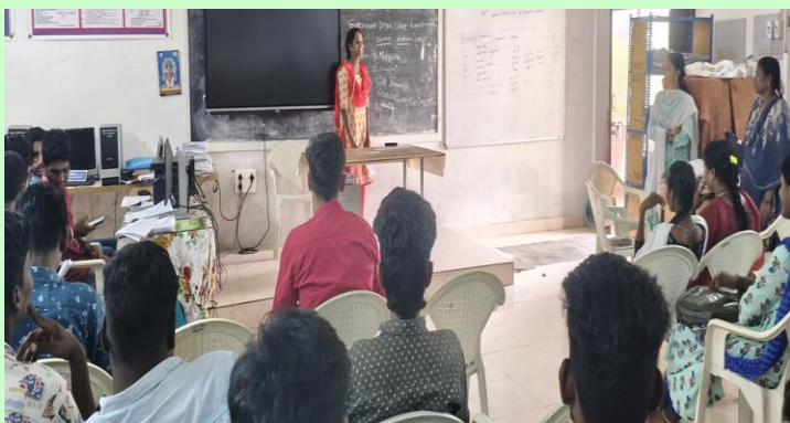
Student Seminar Program – Commerce Dept