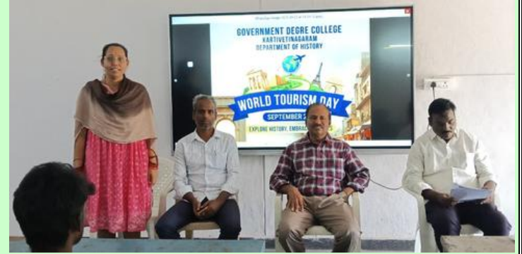
World Tourism Day - History Dept