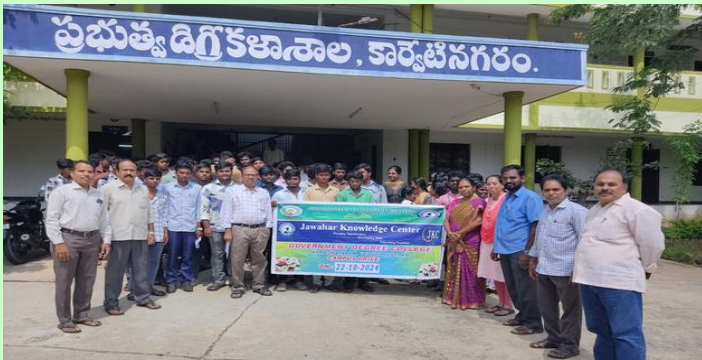
Job Mela - JKC